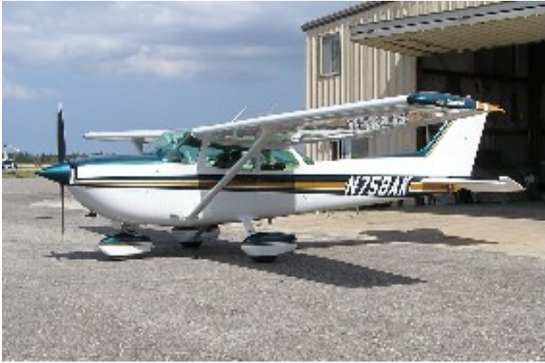
Our 172XP – N758AK