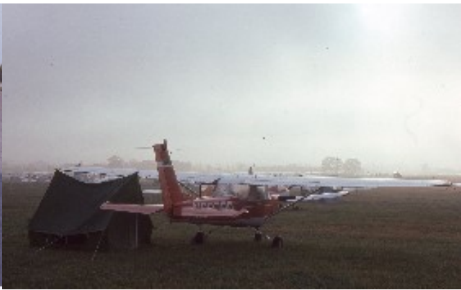
Our Cessna 150 circa 1974 Camping at Oshkosh 197