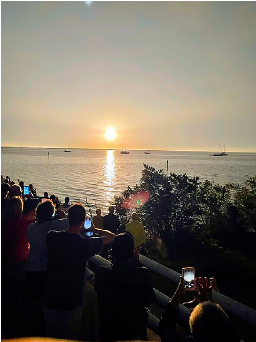
The launch of Artemis as seen from the Max Brewer Bridge, Titusville