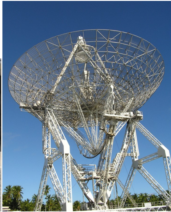
ALTAIR Radar Antenna