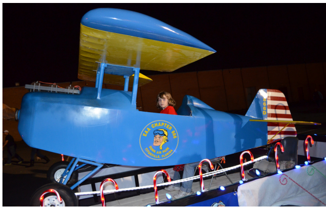
2013 Chptr 866 Christmas parade float

We'll use my truck again this year unless someone else wants to use theirs.