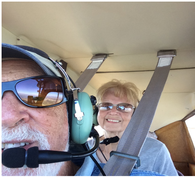
Flyin to GIF