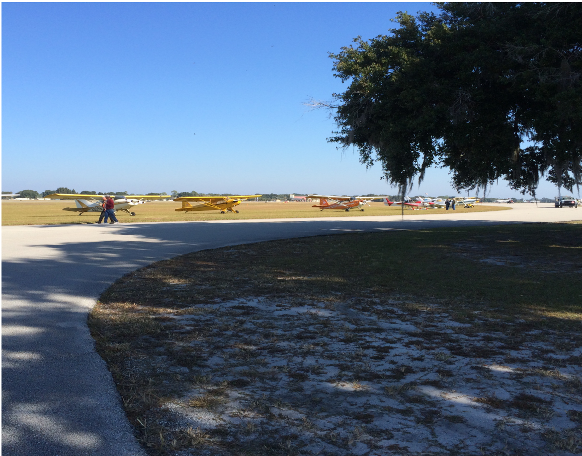
Lots of tail draggers at Winter Haven annual fly-in