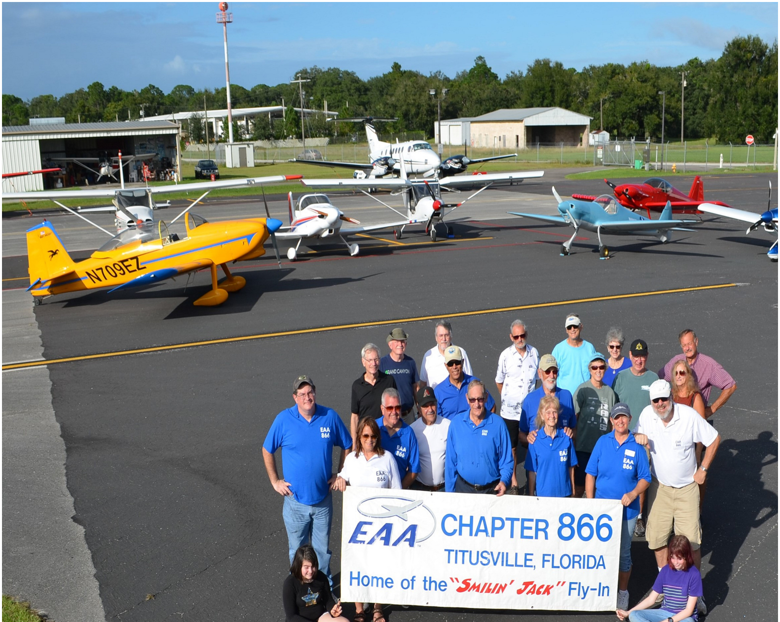
A display of some of our chapter airplanes and some of our members who showed for the Oct. 24 chapt. event at Dunn