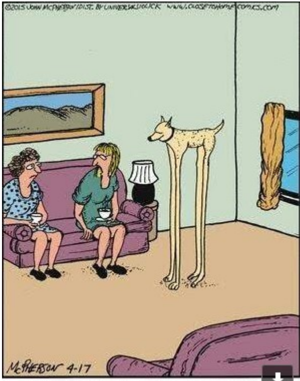
"He's a Chihuahua/Great Dane mix."