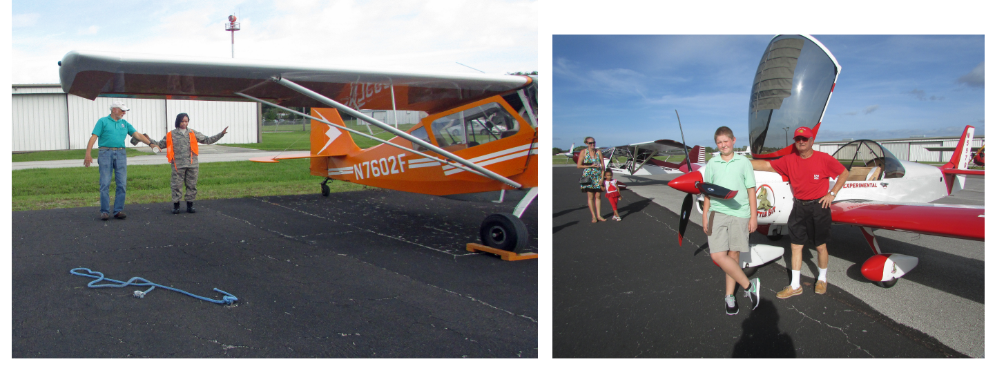
My favorite ride was with this girl. So eager to learn! We're discussing roll control.