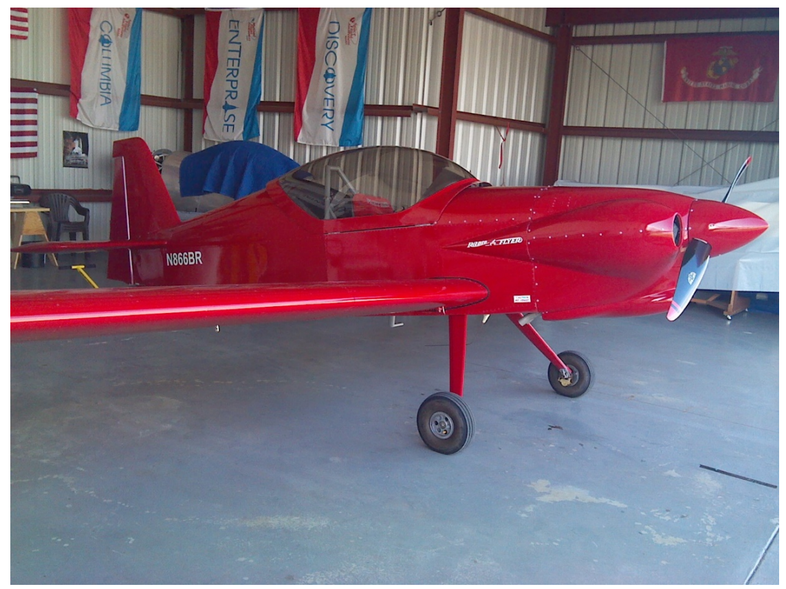
The Panther LS sport plane. N866BR, our 'Little Red Wagon' of the sky