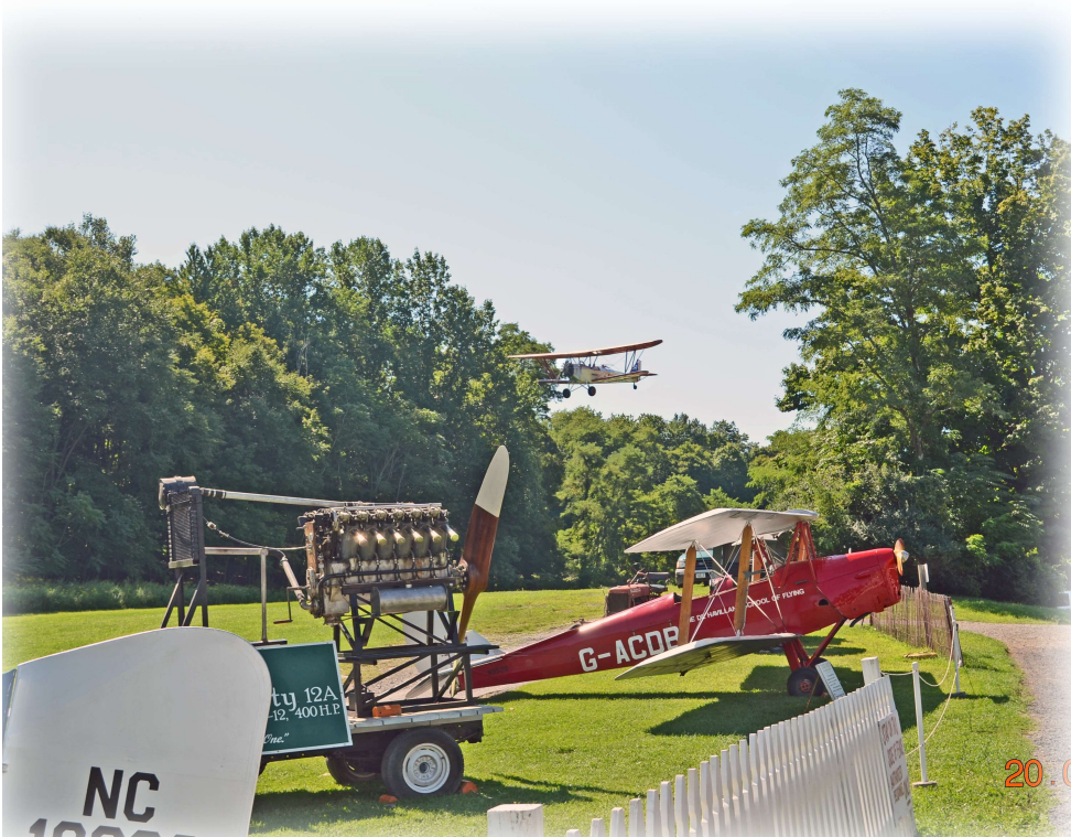
New Standard D25 on final

At Old Rhinebeck there are 4 museum bldgs. And a stunning array of historic old airplanes and old motorcycles and cars all WWI vintage.