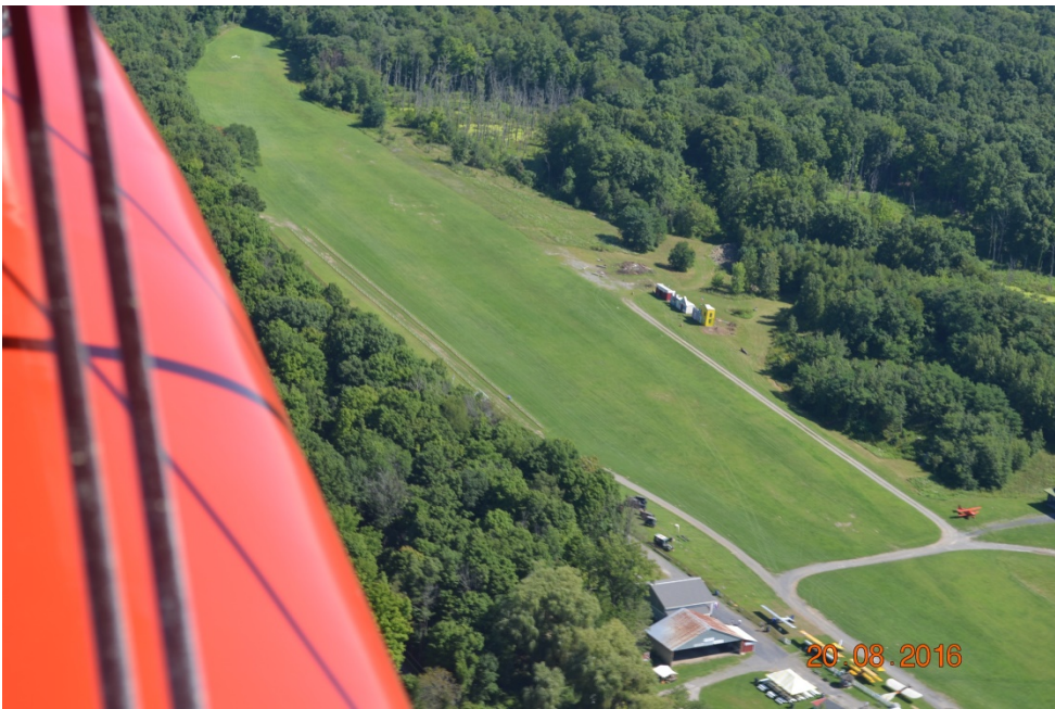
Old Rhinebeck Aerodrome