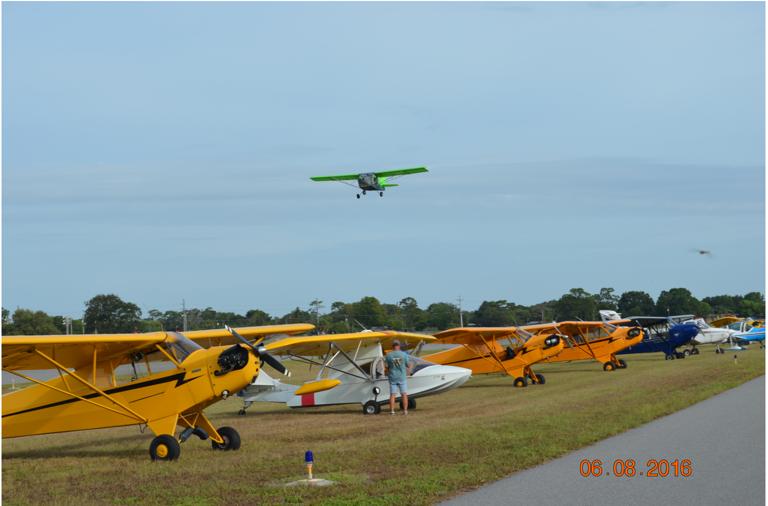
Nice line up of fly-in airplanes at our August breakfast- Chapter 866 Officers