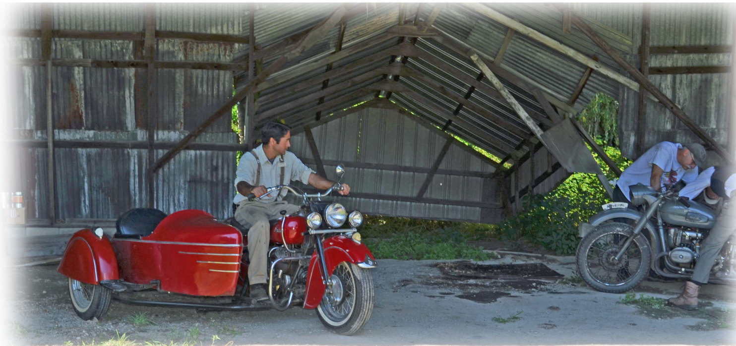
Old motorcycles with sidecars are readied for the weekly show