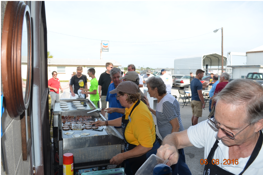
Cooker hard at work

The August breakfast was a huge success with 37 aircraft showing and about 167 eaters. We got a lot of compliments from visitors on our breakfast because our outstanding crew did an outstanding job!