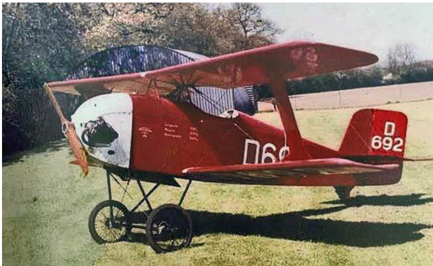
The Flitzer (under construction)