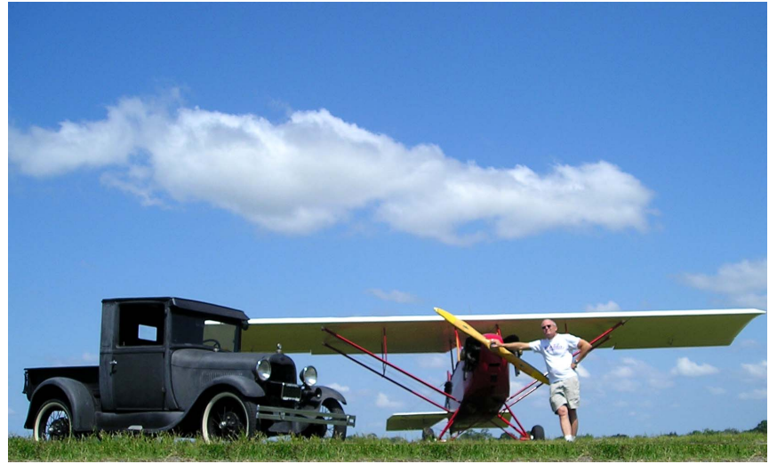
Pietenpol and Model A Ford