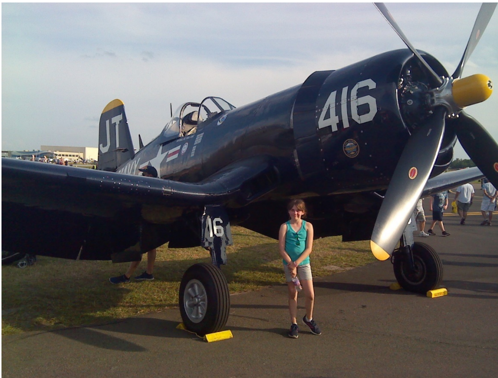
The beautiful Tobul F-4U Corsair