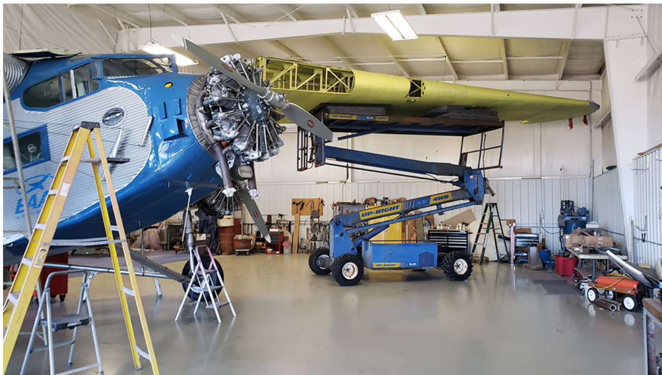
The effort to replace the wings on the EAA 4AT Tri-Motor is progressing nicely.

https://www.eaa.org/en/ea/news-and-publications/ea-news-and-aviation-news/news/03-07-2019-Keeping-EAAs-Ford-Tri-Motor-in-the-Air-Tin-Goose-Alert