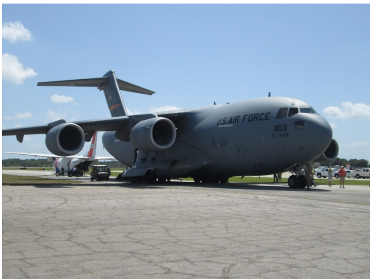
C17 Globemaster at TICO Airshow, April 6 th , 2018