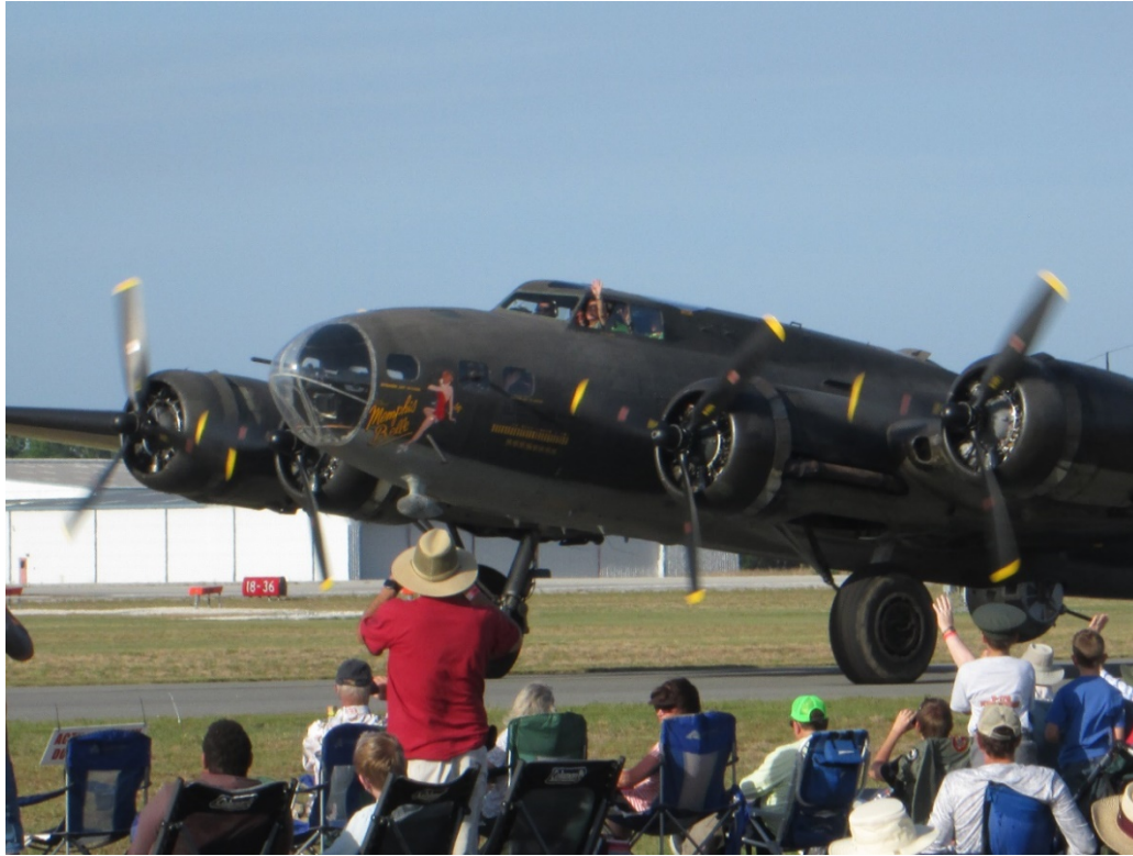
Scenes from the Tico Warbird Airshow

Pearl Harbor flown this year at the TICO show! There were 8 vintage airplanes painted in period Japanese markings. They flew a highly choreographed routine for nearly 15 minutes, simulating the chaos of the attack with numerous low passes in every direction, making torpedo and bombing runs, with lots of ground pyrotechnics and smoke going off with every fly over! It was quite something to see. For just a moment, it made me think about how stunning and terrifying it must've been to witness the real thing back on that infamous Sunday morning in 1941. May we never forget our history. Some of the re-enactment airplanes were the very ones used to shoot the 1970 movie Tora! Tora! Tora! , and a couple of them were the same airplanes used in the filming of the movie Final Countdown which we just recently watched a coupla months ago at one of our Chapter 866 movie nights. I also crawled through the B-17 bomber at the Warbird airshow, it was a movie star airplane too, and was used in the leading role for the filming of the 1990 movie, Memphis Belle .