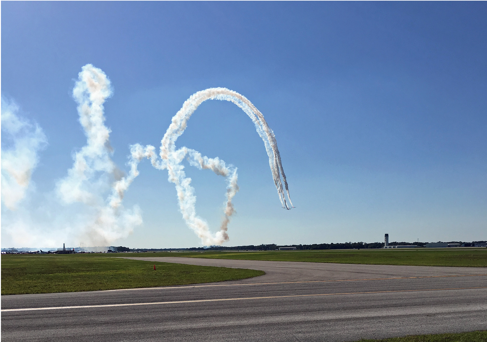
Sun n Fun 2018 evening Airshow