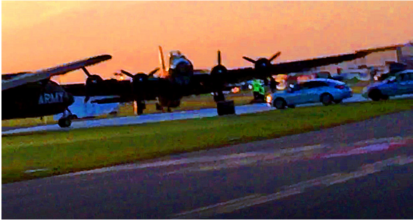
Sunrise over the Warbirds Sun n Fun 2018