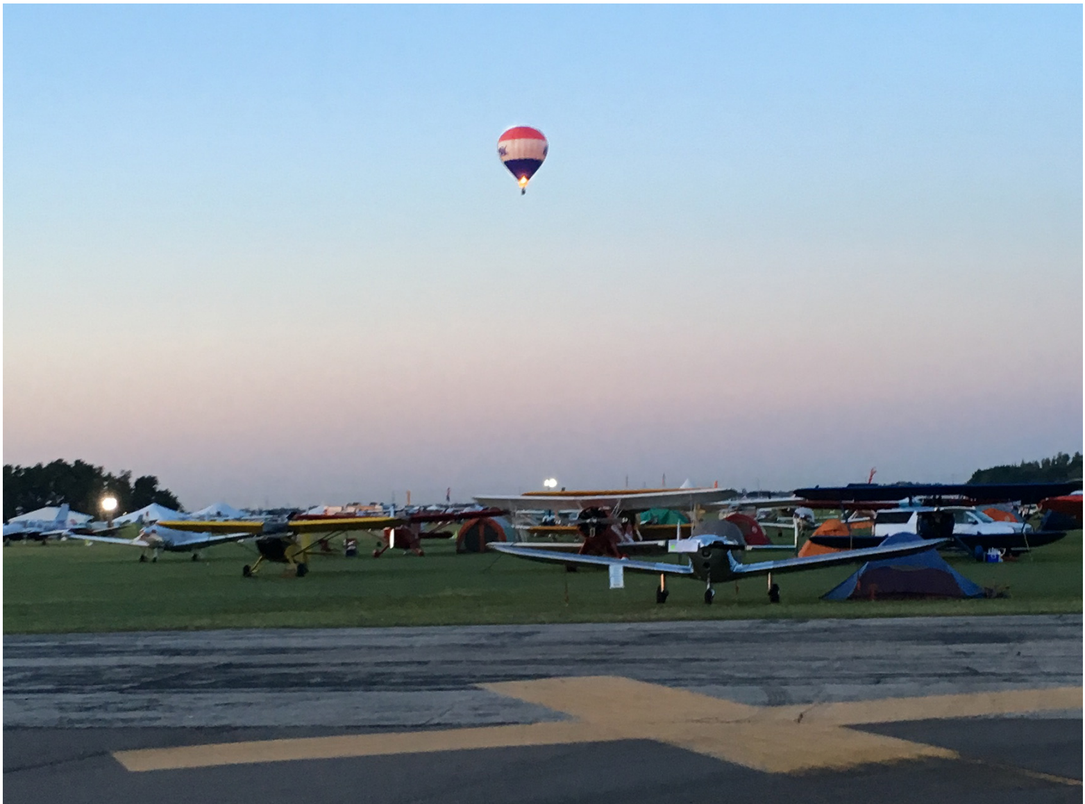
Our crew starts before sunrise each day, this picture was taken at sunrise from my post this year at Sun n Fun