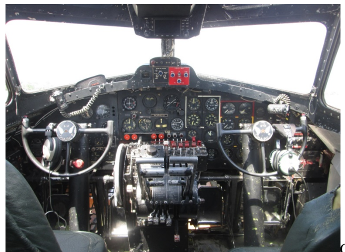
B-17 Instrument Panel

So, I hope you've all had the chance recently to enjoy some airplanes and get together with some great aviation friends.