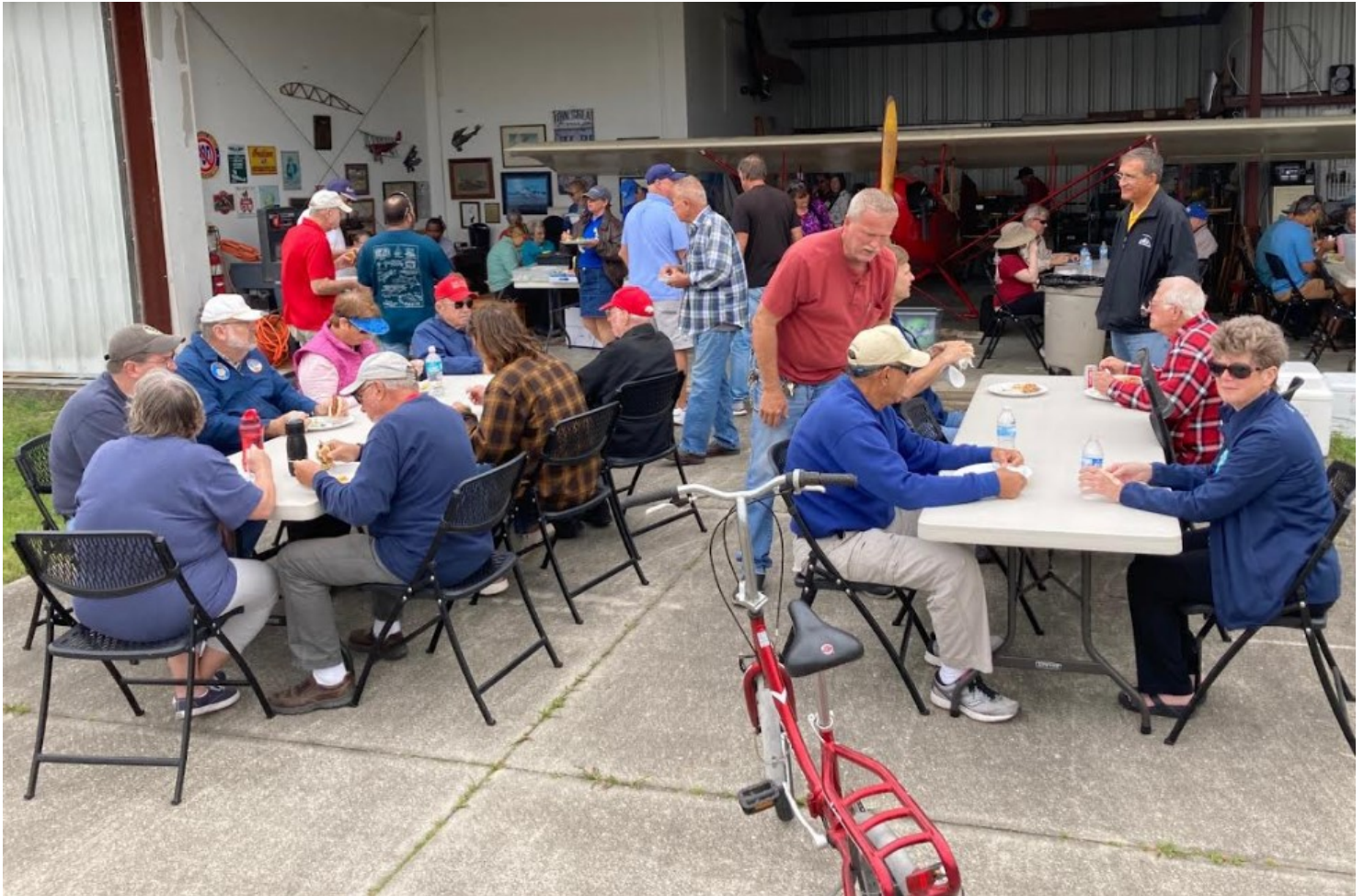
Some of the open hangar day participants enjoying eats at Ben’s hangar at Dunn Airpark March 20, 2021