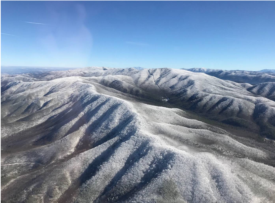
Snowy Mountains on the east side of the pass

Greeneville, TN airport is on the north side of the 2 nd mountain range near the Asheville Pass. Dropping down into the cold air between both mountain ranges – back in the 20 degree F range- so cold! Refueled and took a potty break a Greeneville then onward through the pass.