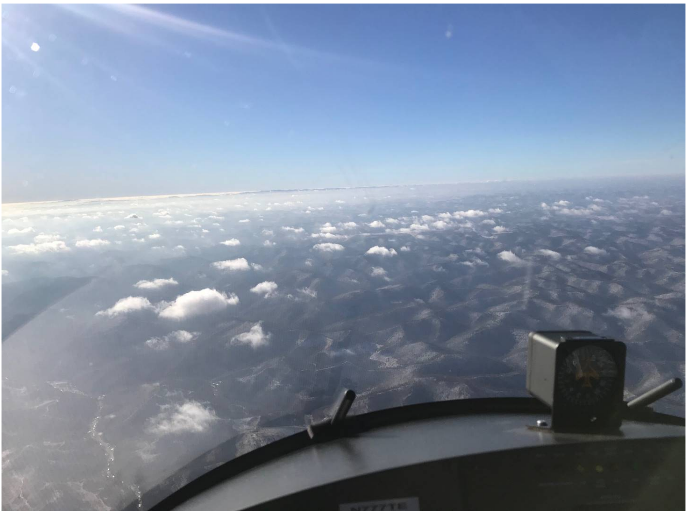
My Gyroplane flies faster above the clouds @ 5,500' with the Appalachian Mountains in the distance. The sun helped keep me warm (along with the heater on the passenger side).