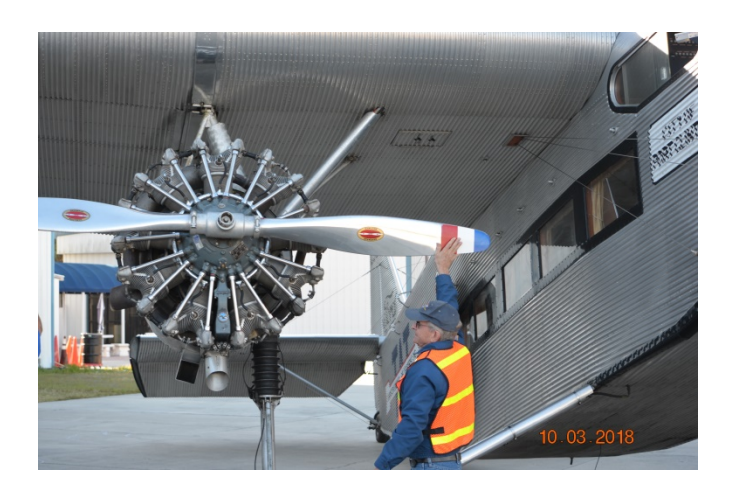
Kip preflights TriMotor