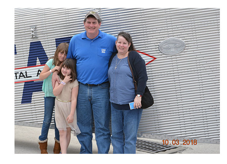
Boatright family w/ TriMotor