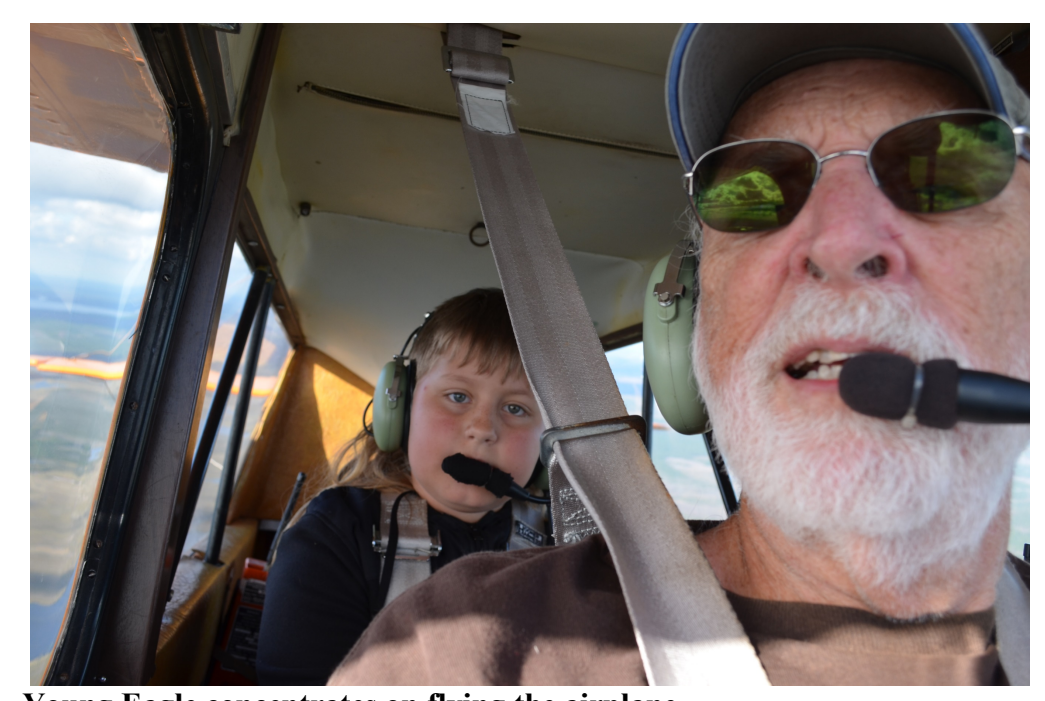
Young Eagle concentrates on flying the airplane

When I got to our hangar that morning it appeared that Santa had visited. There was a five gallon container full of 100LL in the hangar! (thanks, Les)