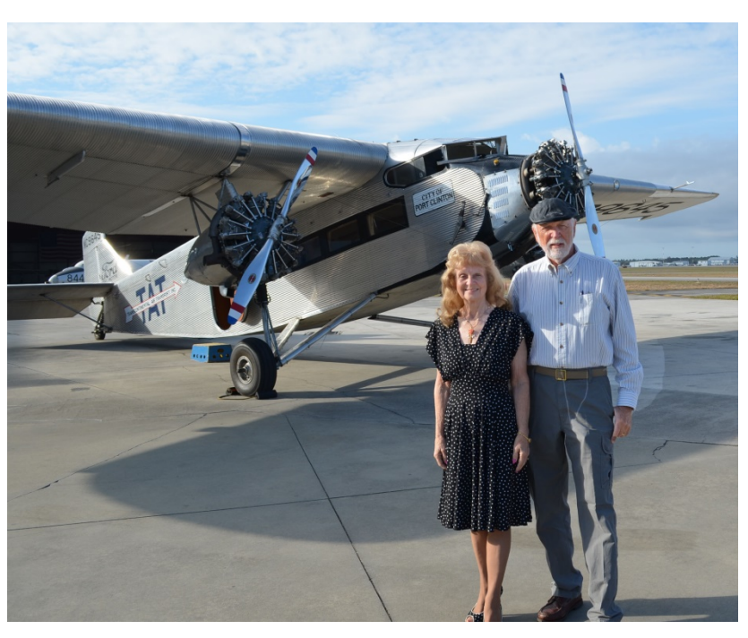
This was a photo- op for our Christmas card picture.