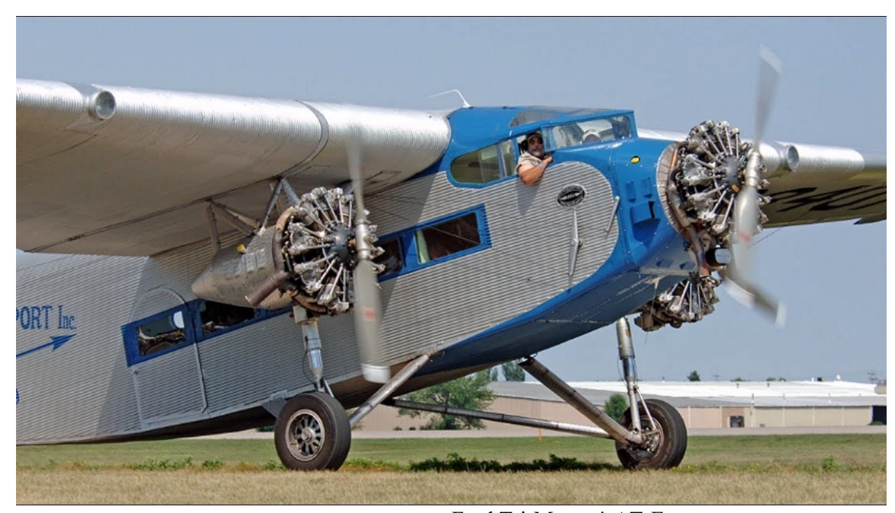
Ford Tri-Motor 4-AT-E

In Other Tin Goose Historical News . . .