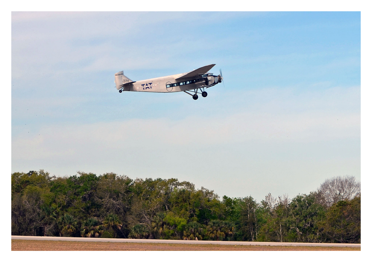
The 90 yr. old TriMotor flies another full load of passengers at Space Coast Regional!